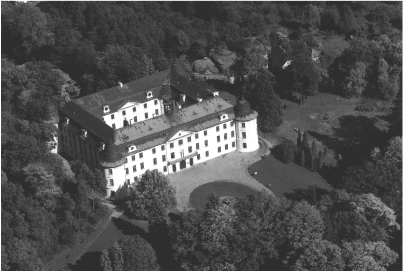
FROM ZAHRADKY CASTLE POSTCARD