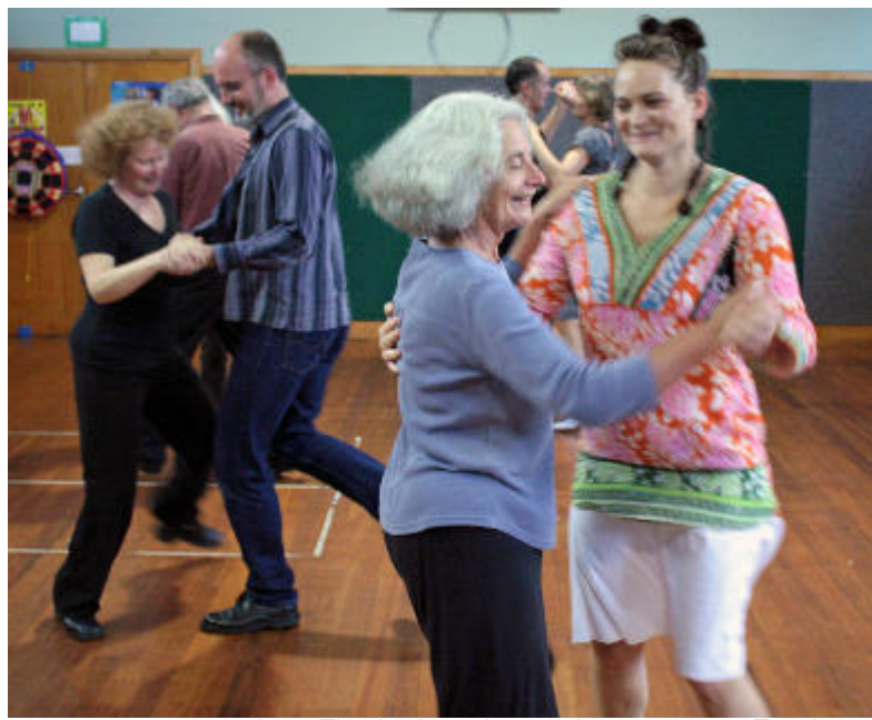
that The body is the media for music. To play it, I need to feel the dance."

She likes to use a CD player as little as possible, preferring instead to use live instruments played by herself and her musician friends. "For me, dance and music have always been the same thing. One does not exist without the other. Twenty years of dancing to drums teaches you