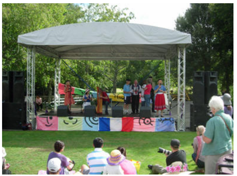
Full resolution images available on the Gallery page at folkdance.org.nz

Les Trois Amis sounded great – a lovely combination of button accordion, harp and flute – their music gave us the right 'lift'. Our 4 singers Les Cigalles (their choice of name meaning the cicadas!) sang tunefully and