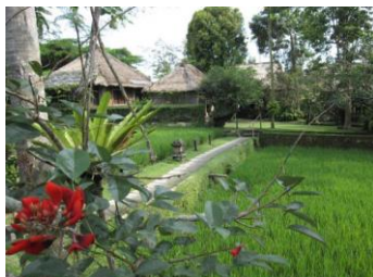
Our bungalows at ANANDA COTTAGES

Group booking (6 or more persons before deadline): € 875