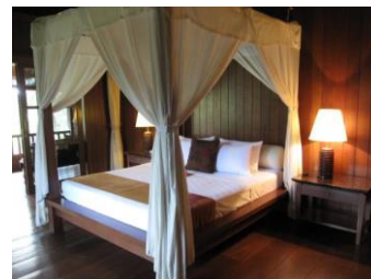
The rooms: www.anandaubud.com

This tour is open to folk dancers (and partners) from all over the world, therefore all dance classes, guided tours and communication will be in English.