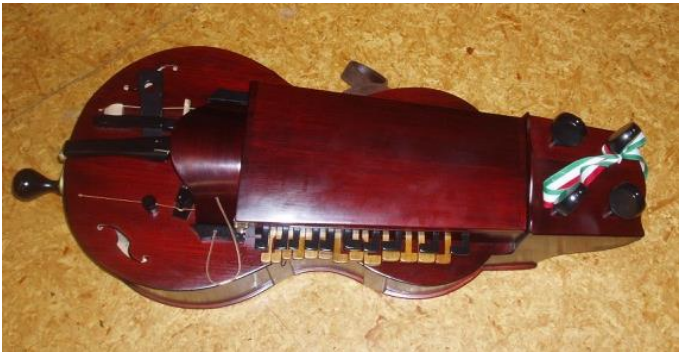
Rob's hurdy gurdy