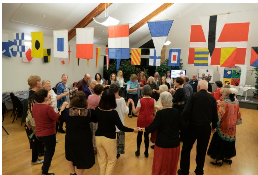
Ruritanian Club 40 th